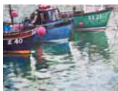
Lornas' St Ives 40cm x 30cm £350