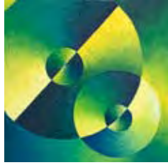
Green Friday 2 30cm x 30cm £240