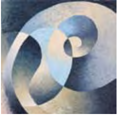
Lunar grey 30cm x 30cm £240