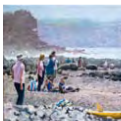
Sandymouth 30cm x 30cm £240