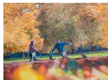
Kicking leaves 79cm x 105cm £1,100