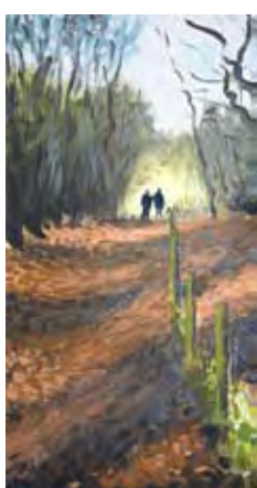
Boxing day at Ayots 30cm x 61cm £350