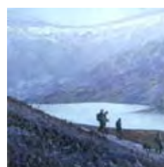
Grassmoor 30cm x 30cm £240