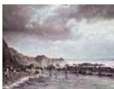
After the squal, Sandymouth 46cm x 35cm £350