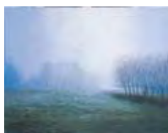
Winter Joggers 46cm x 35cm £350