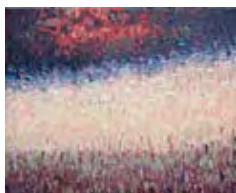
Moon Meadow 1 35cm x 20cm £190