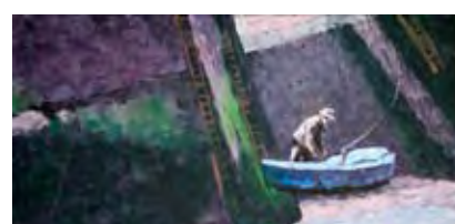
Maryport 30cm x 61cm £350