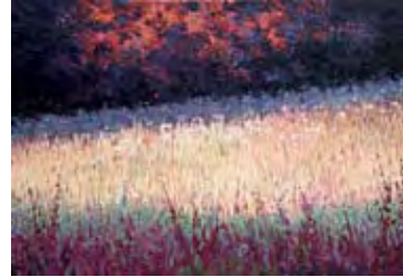
Moon Meadow 2 79cm x 105cm £1,250