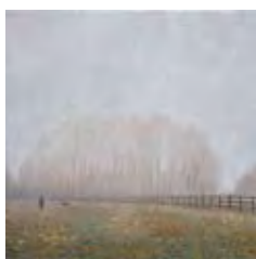
Elkstone dawn 30cm x 30cm £240