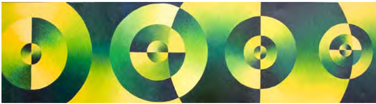
Green Friday 3 152cm x 40cm £750