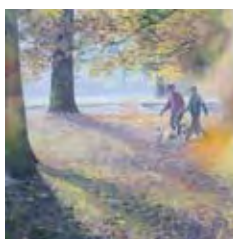
Autumn dawn 30cm x 30cm £240