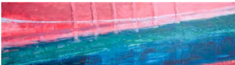
Waterline 152cm x 40cm £750